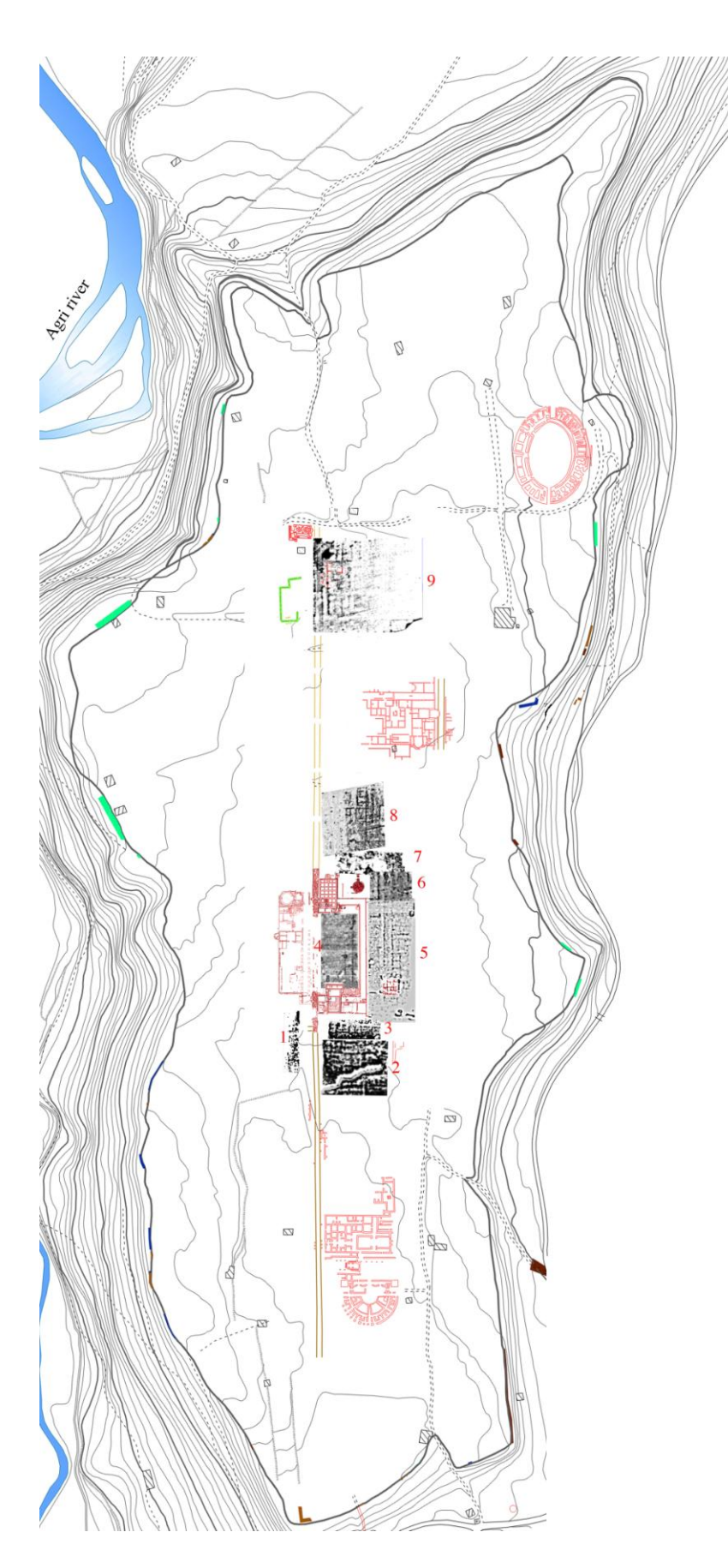
Strutture moderne Strutture con cortina Chiese Strutture in conglomerato cementizio Evidenze archeologiche Strade moderne Strade moderne Strutture di dubbia interpretazione Viabilità antica